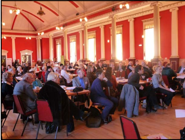
Last year's AGM at Wallsend Memorial Hall